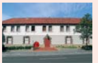
Commissariat Store (1808-10), Tasmania's oldest surviving public building.