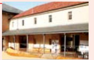
The Queen's Warehouse (1869-70)

The Bond Store (1824-26) Access via the Courtyard Originally served as a Government store for bonded goods such as tobacco and spirits. The Bond Store galleries feature permanent exhibitions exploring 19th century Tasmanian history.