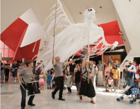
Barking Spider artists performing a previous project

This program is an AccessArt initiative, supported by Detached Cultural Organisation.