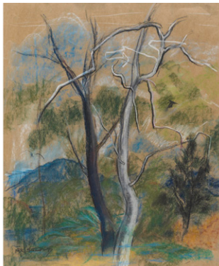
Dorothy Stoner (1904 – 1992) Landscape with Trees 1979 coloured pastels Purchased with funds from the Tasmanian Arts Advisory Board, 1981

Subjects embrace landscape, urban compositions, portraiture as well as abstraction. The approach and intent of each artist is as individual as it is creative.