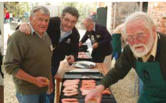
Far left: The Friends' president welcomes guests at one of our special functions for new members.