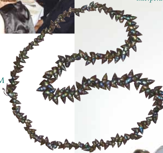
Above: TASMANIAN ABORIGINAL MARINER SHELL NECKLACE

The FRIENDS of the TASMANIAN MUSEUM & ART GALLERY incorporated