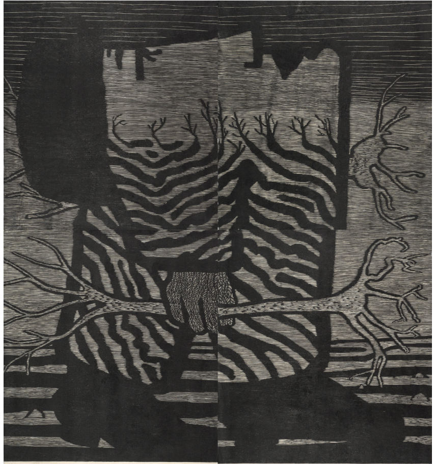
Michael Schlitz, Water bearers , 2005, Relief woodblock print on Japanese Kozo paper.

Exhibition continues until 23 February 2014