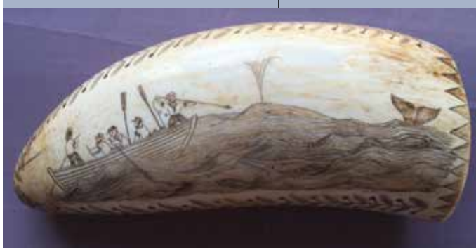
Left: Whale tooth c. 1850 titled 'Whaling at Twofold Bay N.S.W.' Colin Thomas collection

Free entry to Festival bar. Entry to exhibition adult $10, conc $8, child $4. Bookings not required.