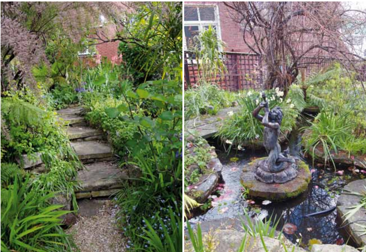
Stone steps and fountain in the Markree garden