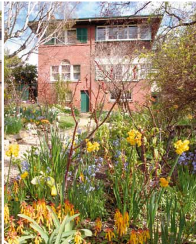
Looking up to Markree house from the garden, c1932 and today