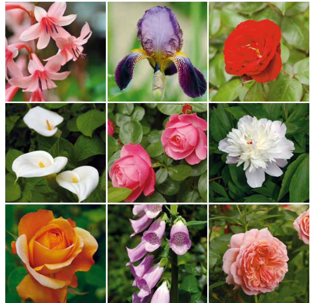
Some of the beautiful floral diversity of the Markree garden