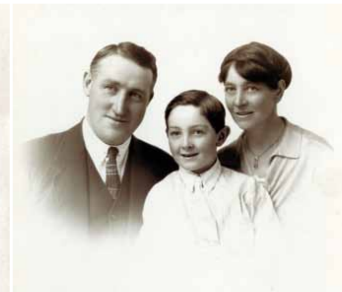
left Markree and Red Knights, c1926