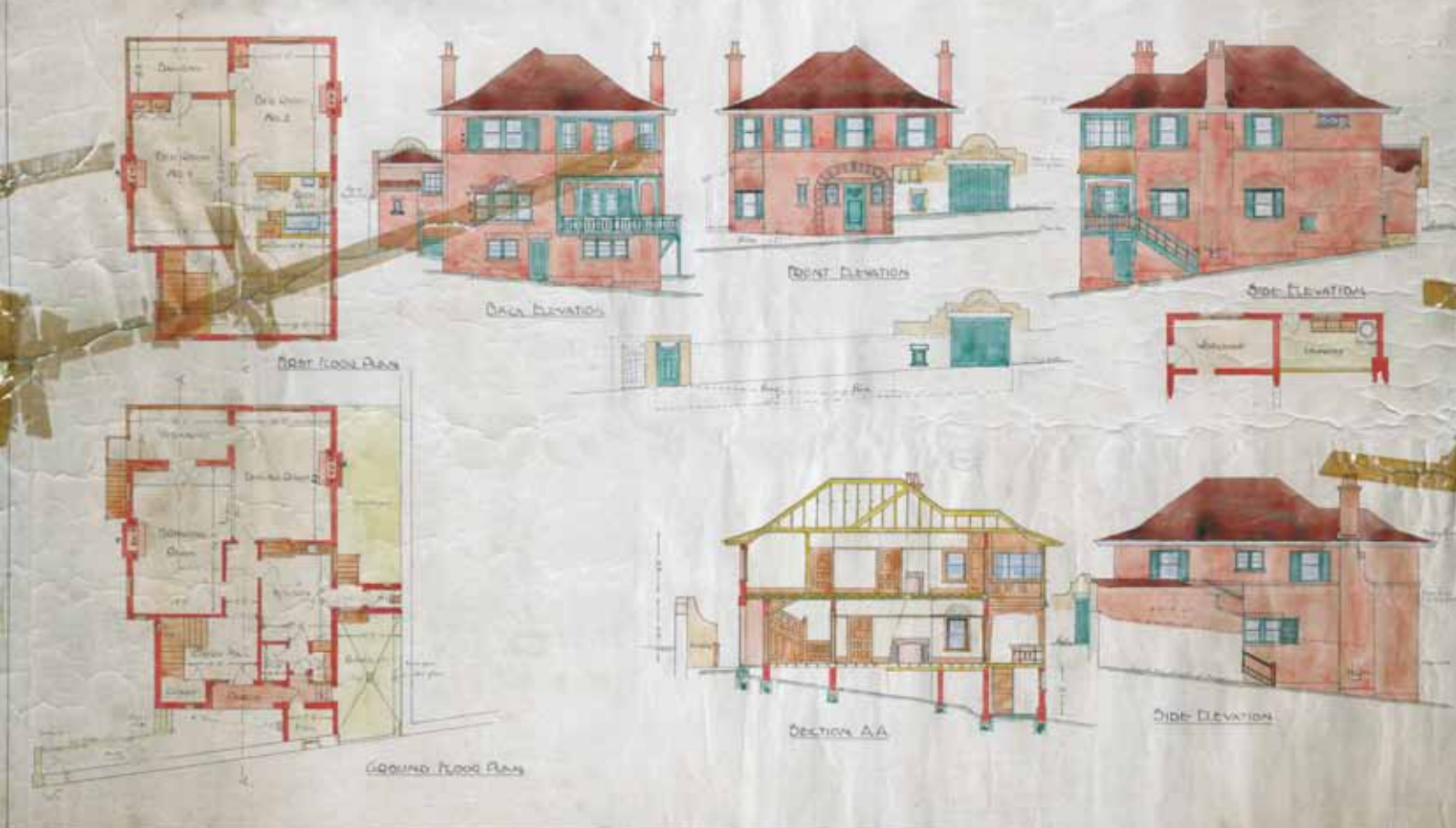
One of architect Bernard Ridley Walker's drawings for Markree, 1925 Hobart City Council